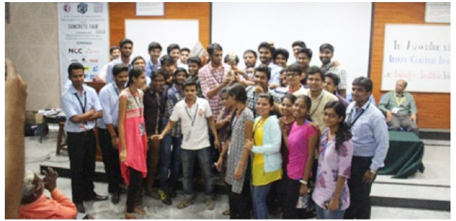
SJCE, Mysore - Overall Champions in UG Category