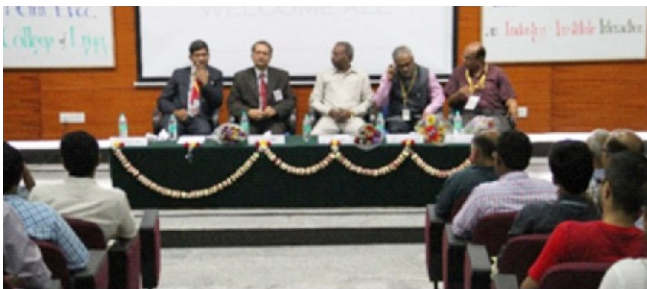
Dignitaries during Inauguration