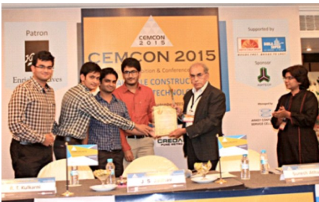
Students receiving the Awards