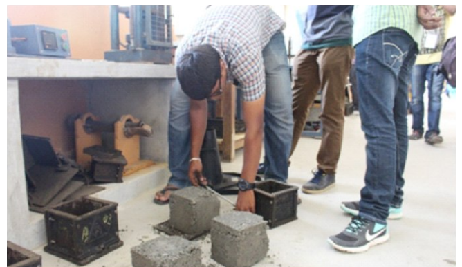
Concrete cube Casting