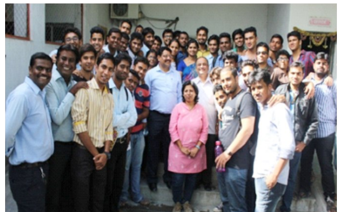
Group of Students, Plant Staff & Dignitaries