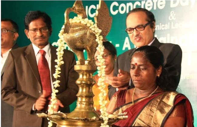
Lighting of Lamp

ICI-Thiruvananthapuram Centre celebrated “Concrete Day” on 30 th September, 2015, organising technical talks on “Sustainable Construction in Concrete using Alternate Materials to River Sand & Usage of Copper Slag in Construction Industry”.