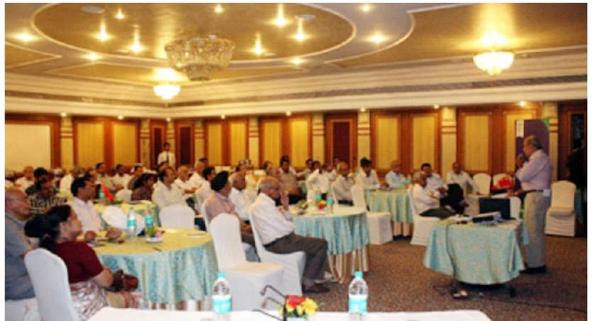
Concrete Day Delegates