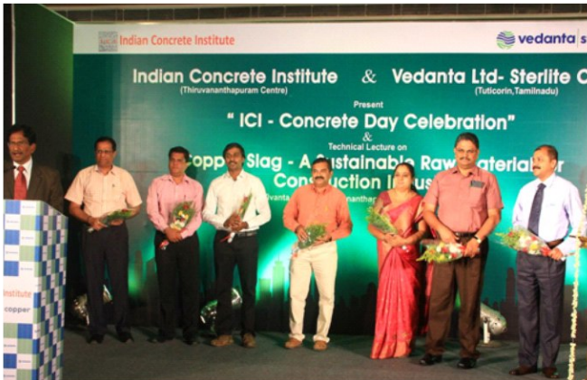
Installation of Office Bearers

ICI-Thiruvananthapuram Centre celebrated “Concrete Day” on 30 th September, 2015, organising technical talks on “Sustainable Construction in Concrete using Alternate Materials to River Sand & Usage of Copper Slag in Construction Industry”.