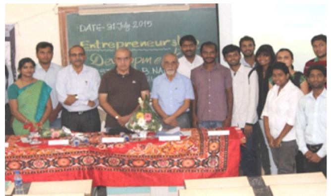
Dignitaries with the Guests