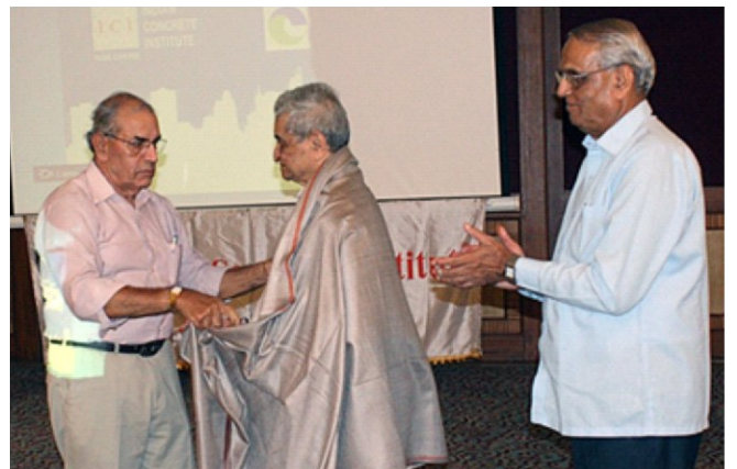
Felicitation of Senior Life members.