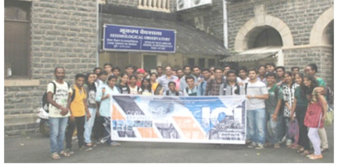
Students at Indian Meteorological Dept, Shivajinagar, Pune