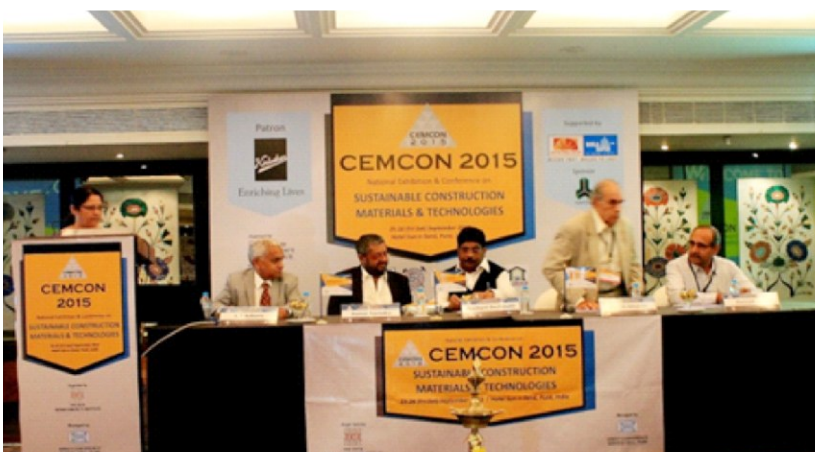
Guests on dais

Around 50 Delegates and 5 Exhibitors had opportunity to interact with each other on these two days.