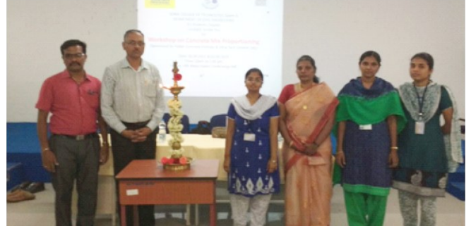
Organizing members with student participants