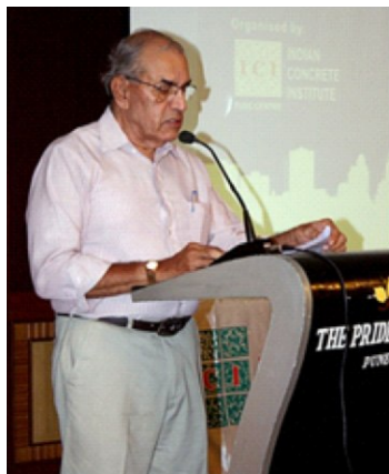
Welcome address by ICI-PUNC, Chairman