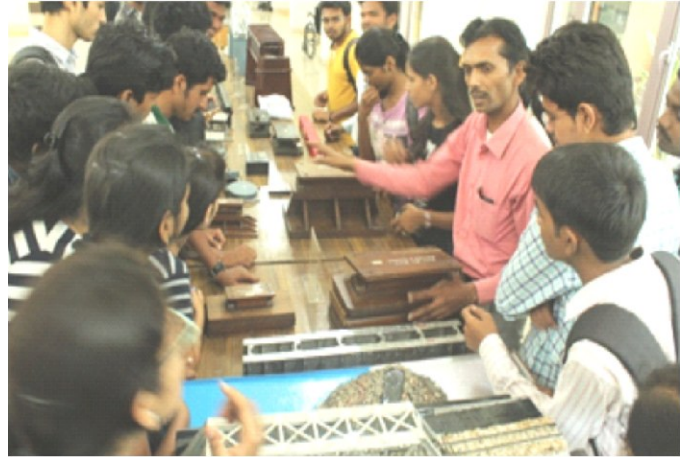
Students at Material Testing Laboratory & Model Room